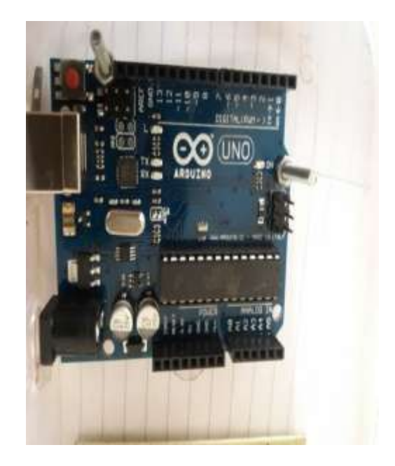
Fig1. Arduino Uno controller

also provide the features for switch which manually controlled device using internet accessibility. So when user not close to device then user also controls the device. For operating device here used Relay module.